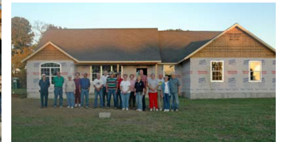
Hoover/Mexico Project, Neosho, MO