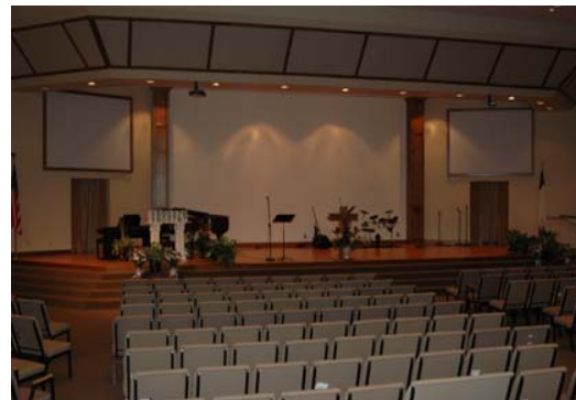
Forest Hill Christian Church Sanctuary