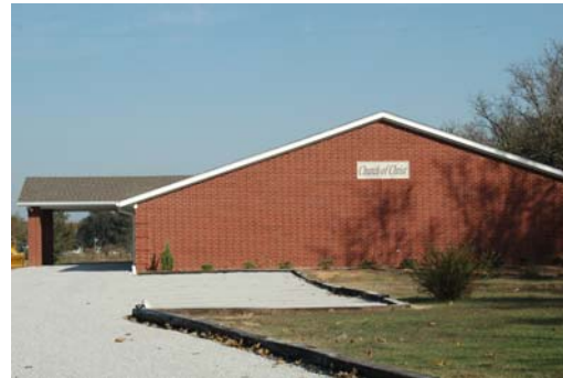
Updated picture of University Church of Christ in Durant, OK.