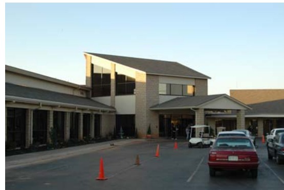
Outside view of Forest Hill Christian Church